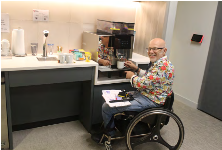
▲ Testing wheelchair access to hot drink machine

“The Health Foundation is committed to embracing equity, diversity and inclusion by building and sustaining an open, inclusive and supportive environment which affirms the rights of individuals to be treated equitably and with respect. The detailed report and recommendations provided by Leonard Cheshire will help us to ensure that our physical workspace aligns with this commitment.”